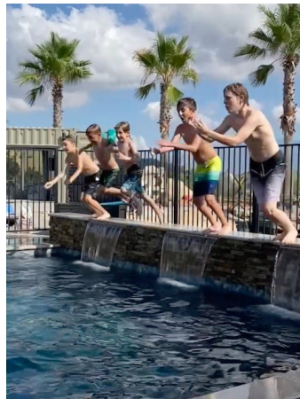
The 5 Grandsons!!