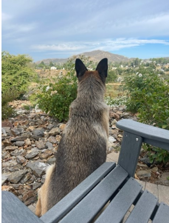
Cali's AM Spot