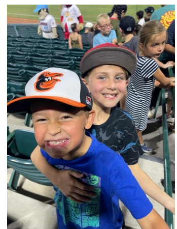
Take me out to the Ballgame!