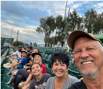
Family Baseball Game